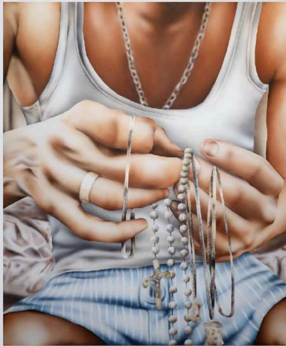
Mattia Guarnera-MacCarthy Untangling Christ, 2023 Acrylic on Canvas 120x150cm